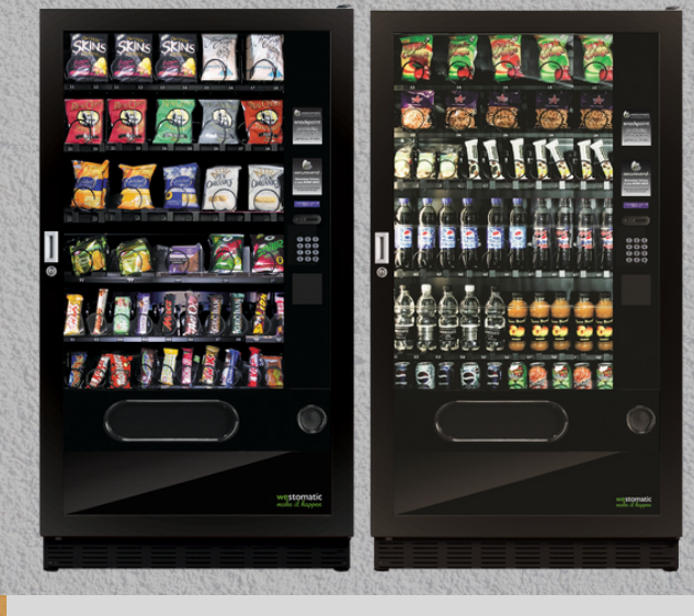
Dimensions: Trio: (H)1830 x (W)750 x (D)790mm

Dimensions: Quattro & Quattro Max: (H)1830 x (W)900 x (D)790mm